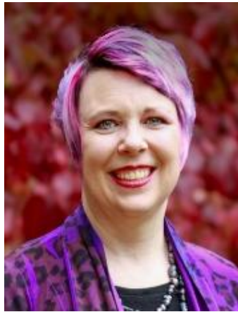
Senior Minister 2025-present